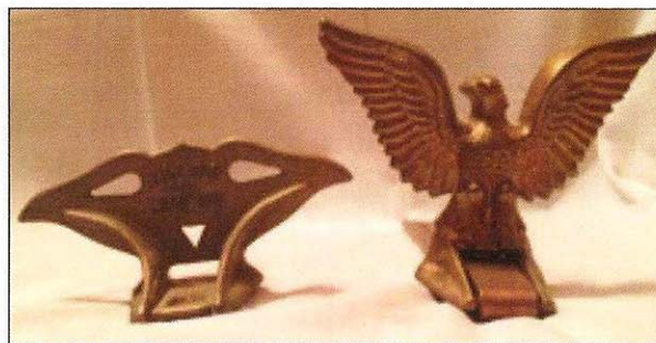
Bronze Models are also Available