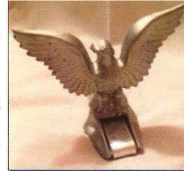
Original Eagle Model