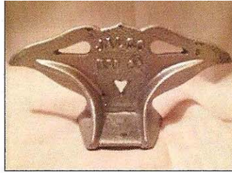
Original Jalco Model