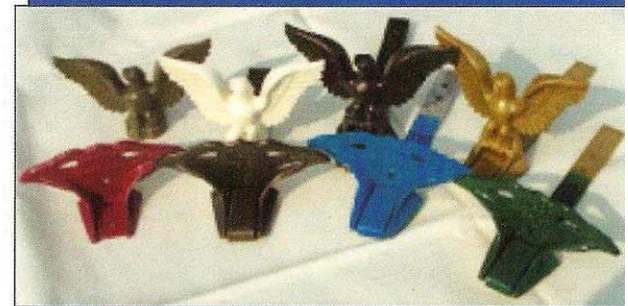
We Powder Coat Our Snowguards Any Color You Need